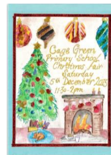
Sophia – 3W