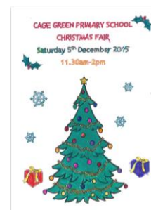
Isabella – 1WK